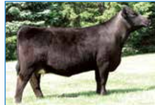
LLSF Neon Rey, Dam