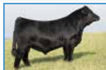
Halls Confidence A30 Embryo Sire