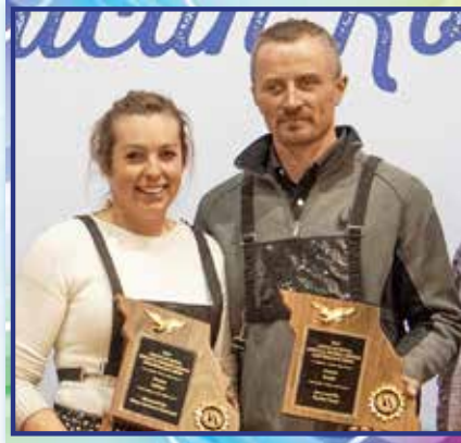
Hilbrands Cattle Company