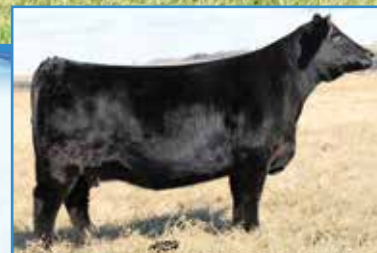
AJE Miss Gracie Y7, Dam