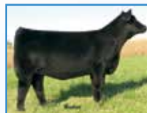
HSF Libby A336 Maternal Sister