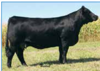
HSF/HS Sheza Beauty U823 Dam