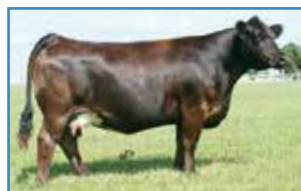
SS Babys Breath P035, Dam