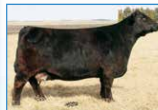
GCC What A Girl 101W Dam

Once in a great while you may find "the one" in a little dive bar...the one that you have waited for...the one that makes you realize that its time to stop messing around with "just heifers" and commit to a true front pasture donor cow. That's Dahlonge and praise Jesus, you don't have to go all the way to Atlanta, Georgia like Ashley McBride sings about. What A Girl was always special and now that she is no long with us, it makes Dahlonge a prime candidate to carry on her legacy. She is so long bodied and giraffe necked. Just watch her video...you will see why we are excited about the future of this Revival daughter.