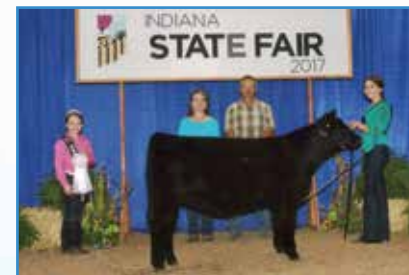
HPW Sheer Elegance

Grand Champion Percentage Bull 2017 MN State Fair