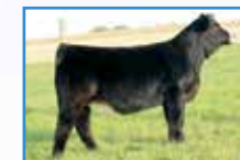
HILB Moonlight Crush B43, Dam

Moonlight Magic is the full sister to the NAILE class winning, $30,000 Moonlit Gaze purchased by Campbell Cattle at the North American last year. Magic has been a sweetheart since birth and is the first embryo baby out of Moonlight Crush or more affectionately known as "Mavericka." We can easily say the first go round to Lookout was not a fluke and Magic is equally as cool as her sister. Since the genetics are holding true, we cannot wait to see what else comes from this stellar young donor. Get in on the ground floor of some up and coming genetics!