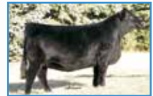
HS Sweet Gem X141N Dam

Another beautifully made Built Right daughter that is going to make a tremendous cow. She's extremely long bodied, sound on her feet and legs and smooth in her joints. Gem has done a tremendous job for us producing very functional females that have gone on to be big producers themselves. A Gem granddaughter was crowned the Reserve Supreme Breeding Female at the Kansas State Fair this past year!