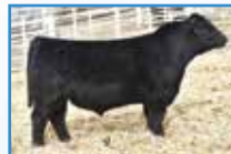
TJ Main Event 503B A.I. Sire

A.I. Sire: TJ Main Event 503B on 6/9/17 • Due: 3/18/18 Est. Plan Mating EPDs: 12 -1.3 82 123 .26 8 23 64 8 11.05 Carcass: 40.6 -.29 .30 -.04 .97 132 84