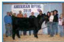
JSF Firefly W46 Dam