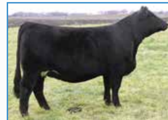
AJE Miss Ella Z77 Dam

S A V Brilliance 8077 PVF Insight 0129 PVF Missie 790 R&R Chamberlain X744 AJE Miss Ella Z77 AJE Gabby R7