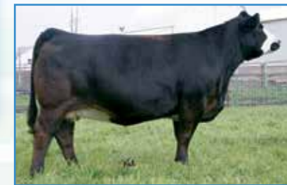
HHSF Black Glitter Dam