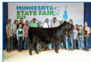
HS Cool Burn C16X Dam

This heifer has absolutely exploded over the last month. Don't get me wrong, she's always had a really neat look to her and we've been big fans, but boy has she really turned it on! Unfortunately, I didn't have her on my radar when I started breaking calves for the sale and the first time she saw one was the day we pictured her. It may be a lose picture but check this one out! She's extremely powerful, huge ribbed, unbelievably sound and still has some look at style about her. We're really excited about getting Cool Burn into production and by the looks of her first natural calf we have every reason to be!