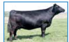
JM Miss Dana N31 Grandam