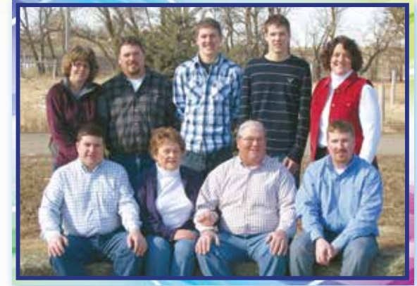
Hecksel Simmental Farm