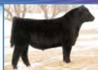
Bushs Unbelievable 423 Embryo Sire