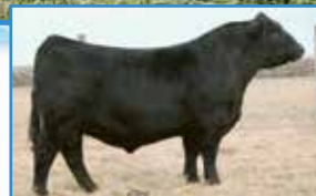
W/C Executive Order 8543B, A.I. Sire