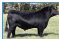
Mr. CCF 20-20 A.I. Sire

A.I. Sire: Mr. CCF 20-20 on 4/10/17 • Due: 1/18/17 Est. Plan Mating EPDs: 12 .8 66 98 .20 9 18 52 9 * Carcass: 29.1 -.32 .28 -.07 .68 124 71