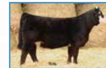
Milliron/GLS Blackout B86, Dam

A.I. Sire: W/C Executive Order 8543B on 4/6/17 • Heifer • Due: 1/13/18 Est. Plan Mating EPDs: 10 -1.1 60 97 .23 7 20 50 8 11.8 Carcass: 26.5 -.37 .13 -.04 1.03 121 72 Pasture Sire: LHT Mr. Executive 166D on 5/6 to 7/2/17