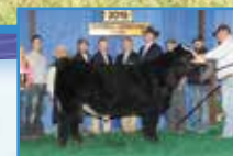
CAJS Blaze Of Glory A.I. Sire

A.I. Sire: CAJS Blaze Of Glory on 5/8/17 • Due: 2/14/18 Est. Plan Mating EPDs: 13 -.15 58 79 .14 6 18 46 8 11.45 Carcass: 16.4 -.30 .33 -.04 .68 121 68