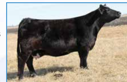
AJE Gabby R7, Dam

LLSF Uprising Z925 HILB Oracle C033R SS Babys Breath P035 3C Macho M450 BZ AJE Gabby R7 CMB Glamourama J7