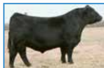
W/C Executive Order 8543B, A.I. Sire

A.I. Sire: W/C Executive Order 8543B on 5/6/17 • Due: 2/12/18 Est. Plan Mating EPDs: 12 -.6 65 100 .21 5 19 52 7 9.3 Carcass: 28.3 -.35 .21 -.04 .96 127 76