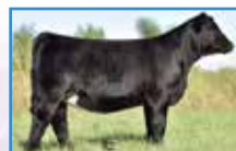
JRB/HSF Jenessa E125 Maternal Sister