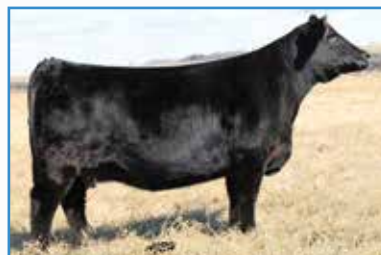
AJE Miss Gracie Y7, Dam

#gameon Retaining the right to one (1) successful flush on Amazing Grace at owner's expense and buyer's convenience with a minimum of six (6) transferrable embryos.