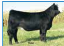
HSF Liberty Bell X004 Dam

A.I. Sire: CCR Wide Range 9005A on 4/14/17 • Due: 1/22/18 Est. Plan Mating EPDs: 11 .25 75 123 .30 10 22 59 12 11.8 Carcass: 43.7 -.34 .09 -.03 1.26 133 78