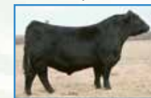
W/C Executive Order 8543B, Lot 24 A.I. Sire