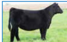
HILB/JLC Dare 2 Impress Maternal Sister