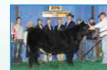
CAJS Blaze Of Glory A.I. Sire