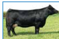
HSF Victoria P30 Lot 74 Dam