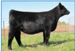
HSF Claudia D607 Full Sister