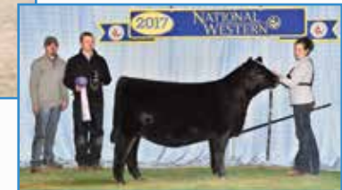
HILB Stare & Believe, Full Sister