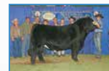
Mr. HOC Broker Lot 23 Sire & Lot 23A Embryo Sire

A.I. Sire: W/C Executive Order 8543B on 5/28/17 • Due: 3/6/18 Est. Plan Mating EPDs: 11 -.8 64 96 .20 7 24 56 7 11.75 Carcass: 26.0 -.38 .21 -.06 .93 125 76