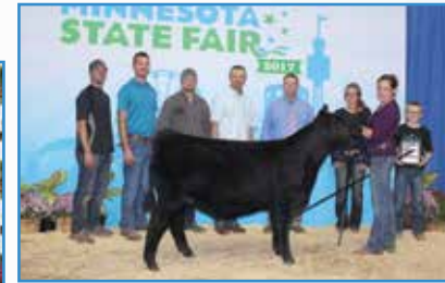
HILB/SHER Undeniable Grace

Reserve Division Winner 2017 Iowa State Fair. Owned & shown by B&L Cattle Co, NE. Daughter of HS Sweet Gem X141N.