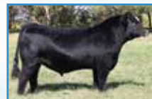
Mr. CCF 20-20 A.I. Sire

Hannah Montana has proven time and time again why she is one of our top donor females with her consistency year after year. Here are three daughters to prove it. D635 will knock your socks off with her moderate frame, big bodied, huge middles, smooth shouldered, big boned, big footed, super sound, awesome front, picture perfect future donor female.. need I say more. C598 is an outstanding fall half blood female that is long bodied, stout made, big topped, good footed, sound and definitely donor quality. D608 is a real moderate made female that resembles the Angus half of her pedigree a little more but is put together really good. All three sell bred to the calving ease bull 20-20 for early January calves. Our 20-20 calves are phenomenal with small birth weights that really kick it into gear from there. We reserve the right to a future flush with a minimum of six (6) transferable embryos to be done at the seller's expense and the buyer's convenience on both D635 and C598.