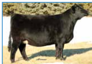
HS Neon Glitz B720 Dam

Neon Glitz is the first Neon daughter we've ever kept back for ourselves. We were pretty excited about getting her into production but unfortunately, she calved early the first year and we lost that calf otherwise, I think you would have heard from her sooner! Check out this beautiful Carver daughter and how well those two combined. Emerald Glitz is stout boned, packed with red meat, extremely sound on the move and super hairy!!! She could be a fun one to play with at Nationals next summer!