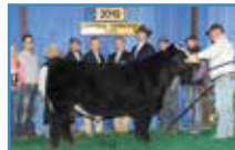
CAJS Blaze Of Glory Lot 56 A.I. Sire