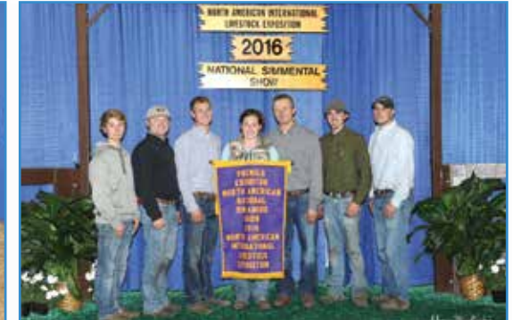
Hilbrands Cattle Company 2016 NAILE Premier Exhibitor