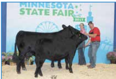
HSF/Learns Bree C510

2017 Reserve Percentage Female MN Beef Expo. Daughter of HILB/SHER Glory Road. Congrats Lorezel Family!