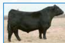
W/C Executive Order 8543B, A.I. Sire