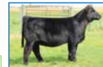
HILB Sent By Angels Maternal Sister to Lot 8

Yardley High Regard W242 W/C No Remorse 763Y DW Susanna 763T SVF Star Power S802 AJE Jewels Halo AJE Jasmines Jewel 43T