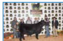
Champion PB Simmental Female 2017 MN Beef Expo Same Cow Family