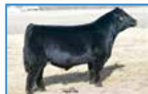
W/C BF Innocent Man, Sire

W/C BF Innocent Man W/C No Remorse 763Y Miss Werning 174Y LLSF Neon Rey Triple C El Poderoso Rey JBS Neon N1001