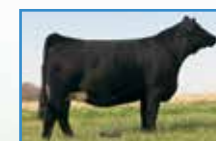
HSF Hannah W986 Dam