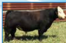
W/C Loaded Up 1119Y Embryo Sire