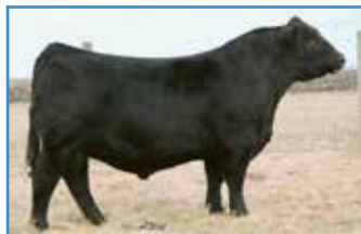
W/C Executive Order 8543B, A.I. Sire