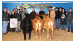
2017 NWSS Res. Champion Pen of 3, Maternal Siblings