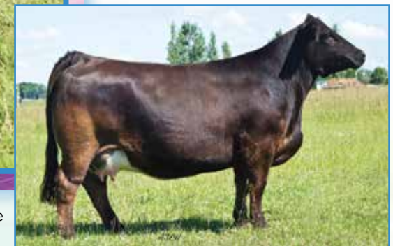
HILB Crazy N Love A475S, Dam

CNS Pays To Dream T759 LLSF Pays To Believe ZU194 LLSF Ura Baby Doll U194 Mr. HOC Broker HILB Crazy N Love A475S SS Babys Breath P035