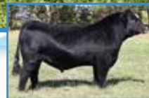
Mr. CCF 20-20 Embryo Sire

Est. PM EPDs: 12 1.25 67 97 .19 7 17 50 8 10.95 Carcass: 29.1 -.40 .00 -.06 .97 113 69 Guaranteeing 1 60 day pregnancy if work is performed by a certified embryologist and 60 day ultrasound paperwork is provided.