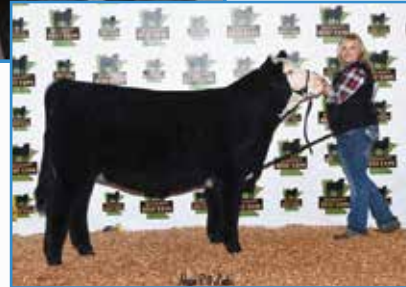
RTL Glorys Dream Girl

2017 Reserve Percentage Female MN Beef Expo. Daughter of HILB/SHER Glory Road. Congrats Lorezel Family!