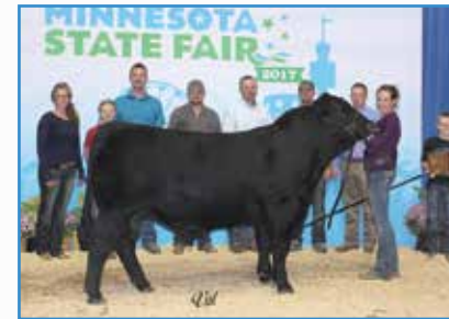
HILB Poseidon D806

2017 MN State Fair Champion Percentage Female