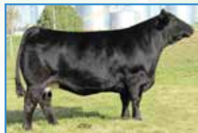
HS Stop And Stare U118L, Dam

Black Polled 1/2 SM 1/2 AN ~ ASA#3299654 BD: 4-28-17 ~ Tattoo: E011 ~ Adj. BW: 84 ET