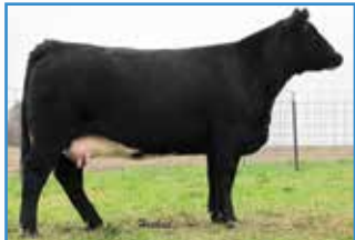
HSF Carmella B410, Dam

This one has been a favorite of mine from day one. This girl has phenomenal rib shape, structure, body, a no holes pedigree and she has the look. Her donor dam, Carmella, is a Victoria daughter that we kept to replace Victoria in the future and she's already proven she is up to the challenge. Sells bred to the hot new 20-20 bull for a January calf. He calves super easy and boy are they good. Retaining the right to one (1) successful flush at owner's expense and buyer's convenience with a minimum of six (6) transferrable embryos.