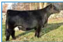
HILB Butterfly Maternal Sister