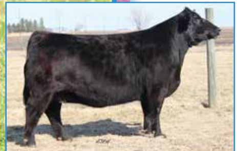
HILB Fairy Tale B5 Dam

In the event the bid is doubled, we reserve the right to split two successful flushes with a minimum 6 transferable embryos.