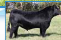
Mr. CCF 20-20 A.I. Sire

A.I. Sire: Mr. CCF 20-20 on 4/10/17 • Due: 1/18/18 Est. Plan Mating EPDs: 10 1.95 69 103 .21 6 17 52 9 10.65 Carcass: 33.9 -.26 .21 -.05 .75 116 69