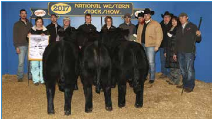
2017 NWSS Reserve Champion Percentage Pen of 3 Bulls