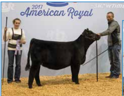
HILB Order of Grace E301 2017 American Royal Reserve Grand Champion Purebred Spring Heifer Calf

JUNIORS - FIND YOUR NEXT CHAMPION ON DECEMBER 2ND IN CLARA CITY, MN!