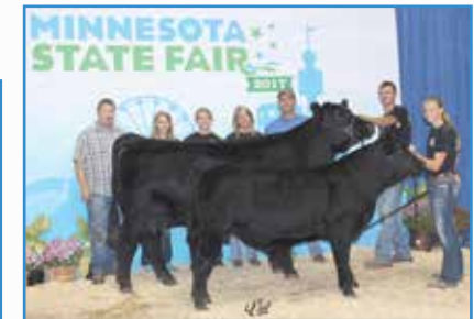
HSF Libby 336

Grand Champion Simmental Bull 2017 MN State Fair. Shown by Hilbrands Simmental.