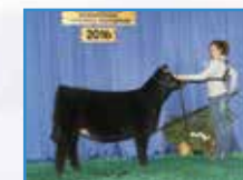
HILB Moonlit Gaze Full Sister