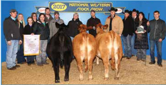
2017 NWSS Reserve Champion Purebred Pen of 3 Heifers