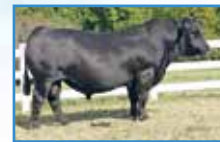
Welshs Dew It Right 067T, A.I. Sire

The mating of EO to Stella has been phenomenal to say the least and I think you'll agree when you take look at these two. Though a year apart in age, they are made so much alike, extremely soft bodied, big ribbed, big topped, big hiped and exceptionally well balanced from end to end. If you are in to the numbers game, these two have an API in the top 30% of the breed! Hilbrands Simmentals reserves the right to one (1) flush, with a minimum of six (6) freezable embryos at the seller's expense and the buyer's convenience on Lots 2 and 3.