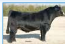
SVF Steel Force S701 Embryo Sire

Guaranteeing 160 day pregnancy if work is performed by a certified embryologist and 60 day ultrasound paperwork is provided.