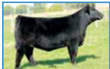
HILB/SHER At 1st Sight Dam