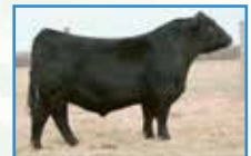
W/C Executive Order 8543B, A.I. Sire