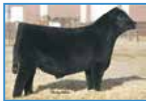
Silveiras Style 9303 Embryo Sire