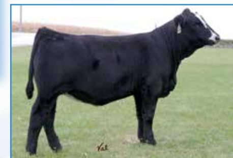
JF Reba 6118S Dam