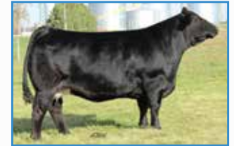
HS Stop And Stare U118L, Dam

I probably shouldn't be letting this powerful female leave the farm. Over the years, her sisters have been Jewels Sale headliners. The number of sale toppers and show winners are too numerous for me to list. I believe this heifer is a true breeding piece. She's bred to Blaze of Glory, and carrying an ultrasound heifer calf.