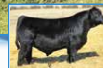
CCR Wide Range 9005A A.I. Sire