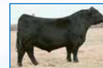
W/C Executive Order 8543B, A.I. Sire

A.I. Sire: CCR Wide Range 9005A on 5/27/17 • Due 3/6/17 Est. Plan Mating EPDs: 12 .7 67 102 .22 8 23 56 15 10.05 Carcass: 31.65 -.34 .23 -.02 1.18 142 76