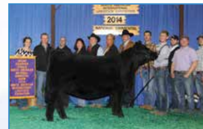
HILB Crazy N Love A475S, Dam