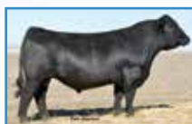
CLRS After Shock 604A A.I. Sire