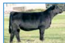
HS Sweet Elegance A5243, Dam