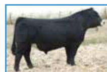
GLS New Direction X184 A.I. Sire