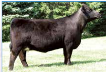
LLSF Neon Rey, Dam

These Neon daughters have made some phenomenal show heifers and if you're looking for something to run with in the percentage division, I think this Uprising daughter is going to be pretty competitive. Check out her video or better yet come see her in person. Her picture doesn't do her justice. I didn't quite have her broke enough yet to relax for a halter pic so we went with a loose one. It's good, but this heifer is really neat. Smooth made and extended through that front one third, sound footed, nice hiped and just a splash of white on the face to get her noticed! She'll be a head turner when she steps foot in the ring next summer!