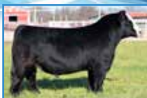
HILB Oracle C033R Embryo Sire