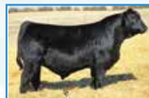
CCR Wide Range 9005A A.I. Sire

A.I. Sire: CCR Wide Range 9005A on 4/5/17 • Due: 1/13/17 Est. Plan Mating EPDs: 11 .0 70 109 .25 11 22 57 12 * Carcass: 34.55 -.30 .28 -.04 .96 133 74