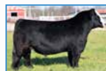
HILB Oracle C033R Embryo Sire