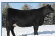
JRB/HSF Kagney C986 Maternal Sister