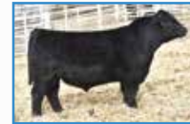
TJ Main Event 503B A.I. Sire

We probably should have worked a little harder at getting this bred heifer out and ready for the show ring this past year, she's so beautifully put together. We've always loved the Built Right females and thought he would be the perfect complement to producing some phenomenal Neon daughters. I think we might have been on to something! Study her lines and her angles. If your income is based on producing show stock, make sure this one is on your short list!