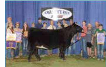
HS Neon Candy C18U Maternal Sister