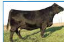
Learns Priscilla Lot 73 Dam