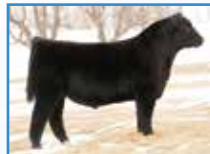
Bushs Unbelievable 423 A.I. Sire