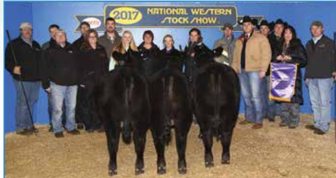
2017 NWSS Champion Percentage Pen of 3 Heifers