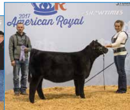
HILB Elaina E421 2017 American Royal Reserve Grand Spring Heifer Calf Division