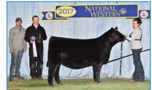
HILB Stare & Believe 2016 NAILE Division 1 Champion & 2017 NWSS Division 1 Champion Congrats Prospect Cattle Co!