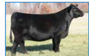
HPF Sazerac Z074 Dam