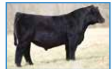
CDI Innovator 325D Embryo Sire