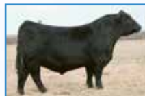
W/C Executive Order 8543B, A.I. Sire

A.I. Sire: W/C Executive Order 8543B on 5/14/17 • Due: 2/20/18 Est. Plan Mating EPDs: 11 -.85 62 98 .22 6 18 49 6 9.2 Carcass: 27.05 -.29 .24 -.02 .96 124 74