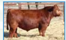
W/C Fully Loaded 90D Embryo Sire

Guaranteeing 160 day pregnancy if work is performed by a certified embryologist and 60 day ultrasound paperwork is provided.