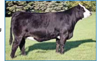
HS Burning Secret B120X Dam

Pedigree for Lots 44 & 45: W/C United 956Y W/C Executive Order 8543B Miss Werning KP 8543U Remington Lock N Load 54U HS Burning Secret B120X Lazy H Burn Baby Burn R34