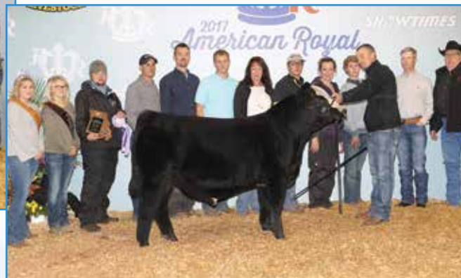
HILB/SHER Data Breach 2017 American Royal Reserve Grand Champion Purebred Bull

JUNIORS - FIND YOUR NEXT CHAMPION ON DECEMBER 2ND IN CLARA CITY, MN!