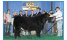
CAJS Blaze Of Glory A.I. Sire

Pasture Sire: LHT Mr. Executive 166D on 5/6 to 7/2/17