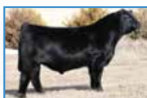
W/C Relentless 32C Embryo Sire