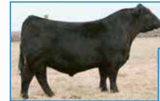
W/C Executive Order 8543B, A.I. Sire

Stare Down and Believe It are both full sisters to the $60,000 valuation HILB Stare & Believe who was Champion Division 1 female at both the North American and National Western this past year. The mating of Stop & Stare and Bushs Unbelievable is the genetic combination we are most excited about to get into production. They have the right phenotypic look combined with great numbers. 139 API on that Executive Order baby coming for Believe It!