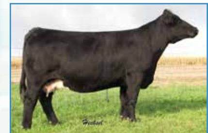
HSF Hannah Montana T771, Dam

A.I. Sire: Mr. CCF 20-20 on 3/30/17 • Due: 1/7/17 Est. Plan Mating EPDs: 13 -.05 63 94 .19 9 19 51 10 10.25 Carcass: 25.7 -.35 .19 -.06 .86 131 73