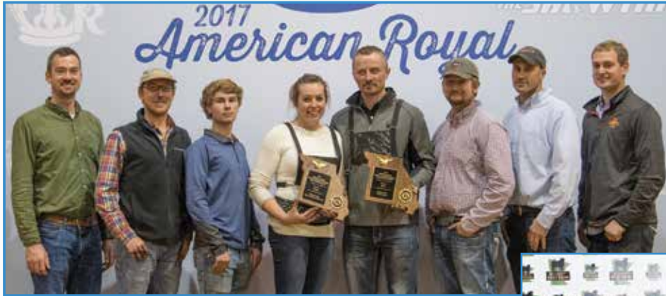
Hilbrands Cattle Company 2017 American Royal Premier Breeder & Premier Exhibitor